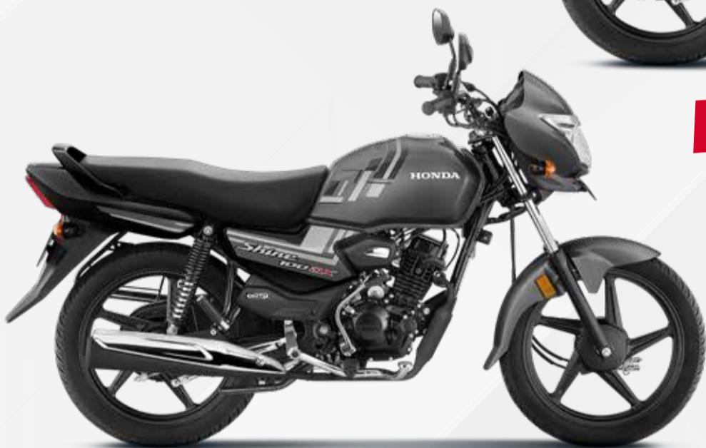
GENY GRAY METALLIC