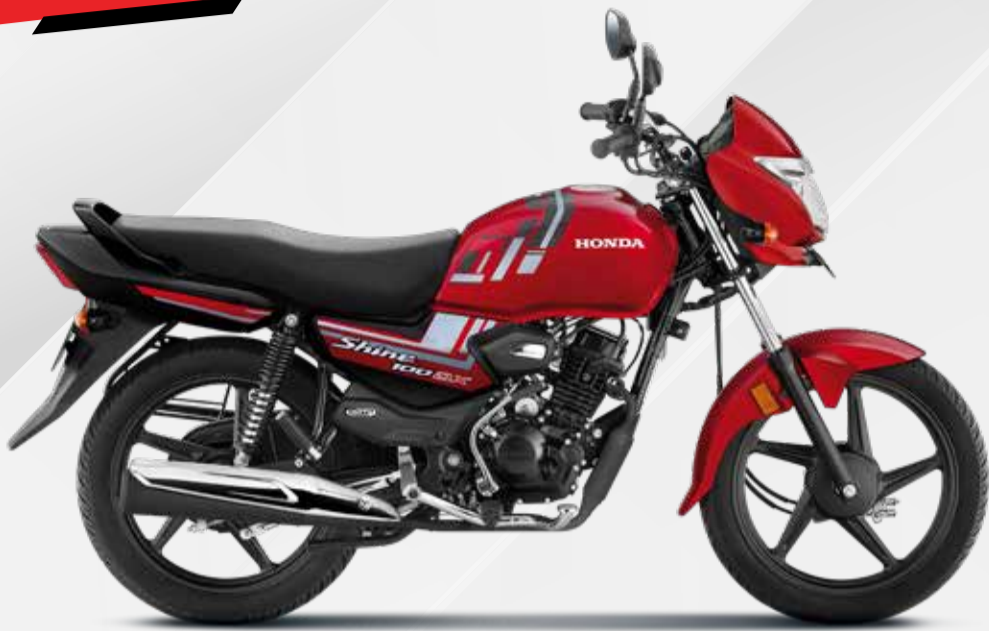
IMPERIAL RED METTALIC